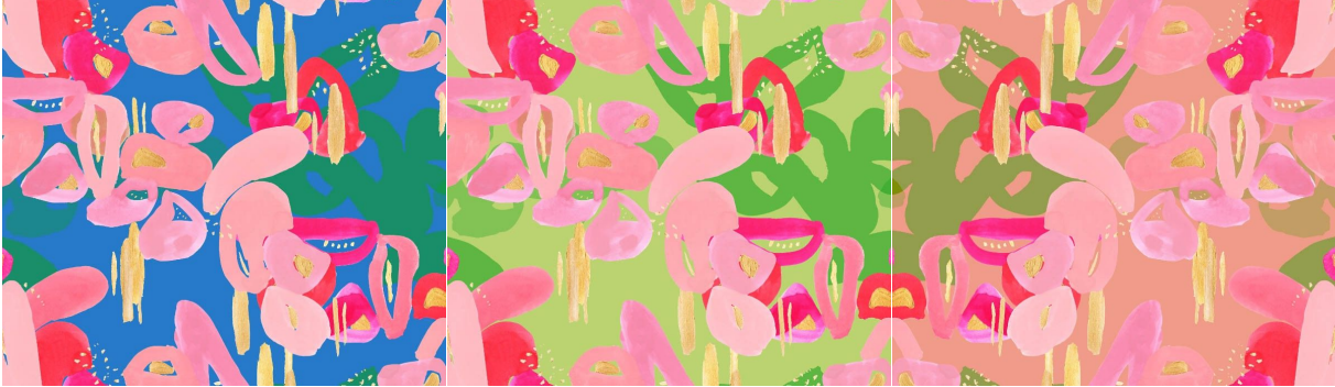
Broken Hearts Blue, Green and Terracotta