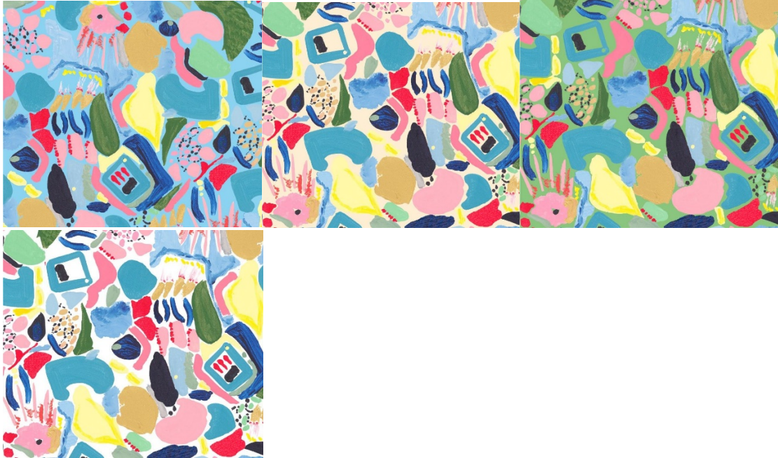
Rabbits and Boats Blue, Cream, Green and White