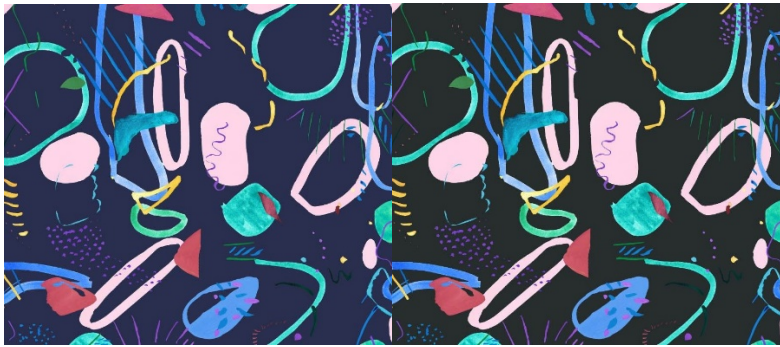
Crystalline Dark and Grey