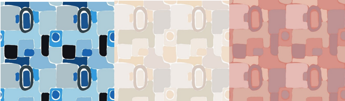
Blue Skies Blue, Natural and Terracotta