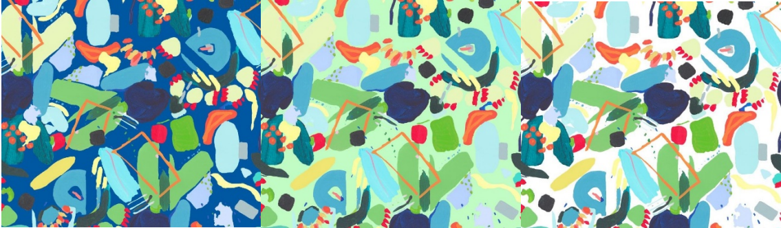
Before Summer Blue, Green and White