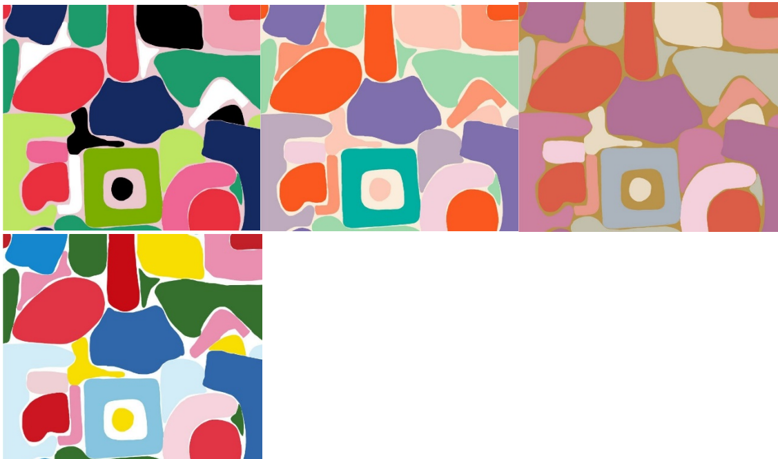
Sunny Side Neon, Purple Peach, Swinging and White