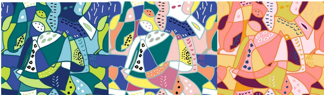
Deep Water Blue, Mint and Yellow