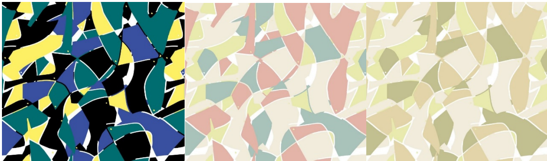
Midnight Gold, Muted and Sage