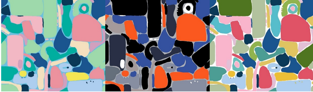
I'm Going this Way Blue, Grey and White