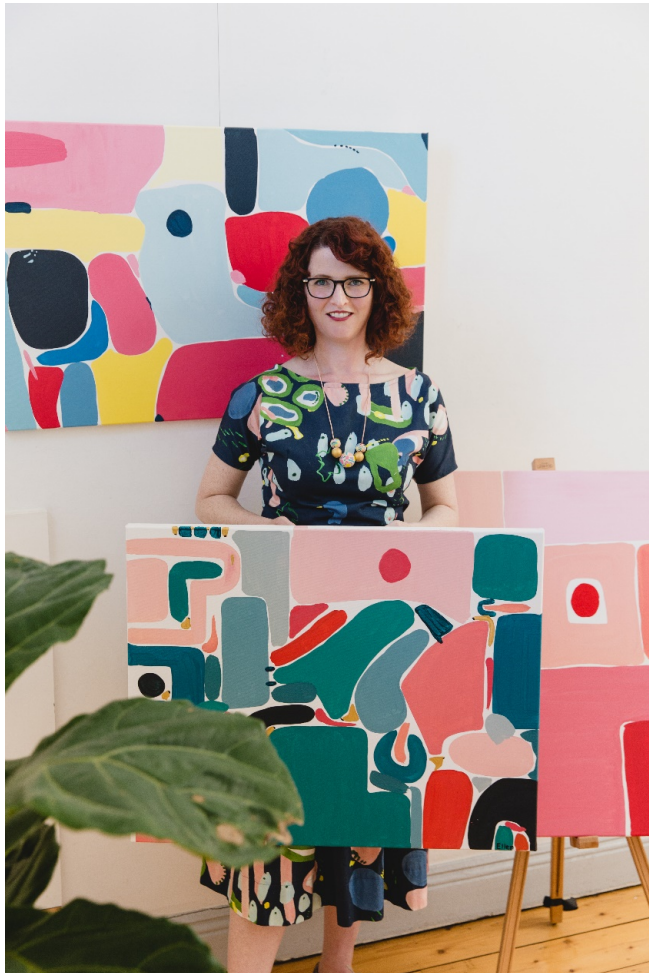
Head Shots